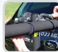
Simple to use release and lock system